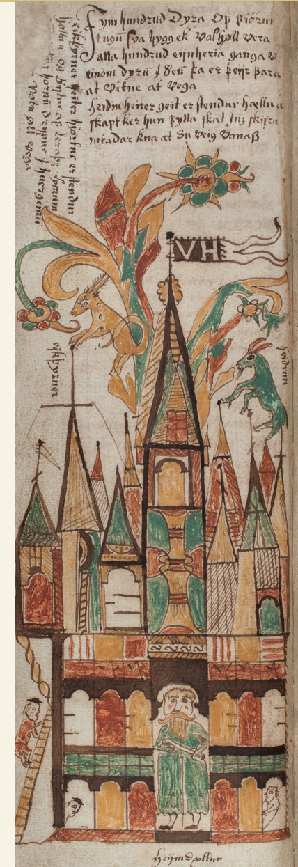
Langa Edda, AM 738 4to, f. 41v The Árni Magnússon Institute of Icelandic Studies, Reykjavík